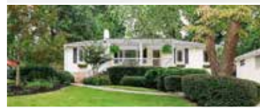
1246 Citadel Dr NE SOLD TO HAPPY BUYER • $705,000

THE MARKET IS HOT! CALL US IF YOU ARE CONSIDERING SELLING!