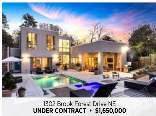
1302 Brook Forest Drive NE UNDER CONTRACT • $1,650,000

Will be 2nd highest sale EVER in LaVista Park!