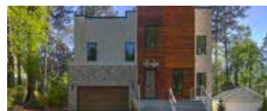
1191 Kingsley Cir NE LISTED & SOLD • $1,255,000

Will be 2nd highest sale EVER in LaVista Park!