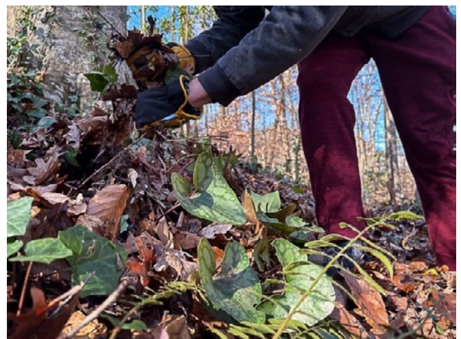
Volunteers turned out on December 14.