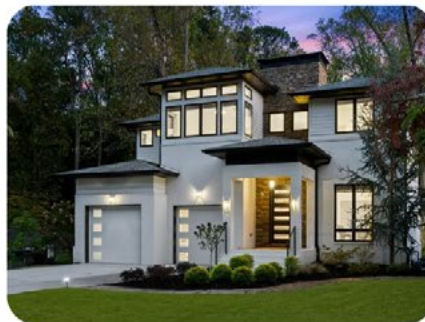
1237 CITADEL NE SOLD $1.740M 1237citadel.com