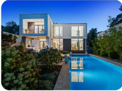
1260 BROOK FOREST DR SOLD $2M 1260brookforest.com