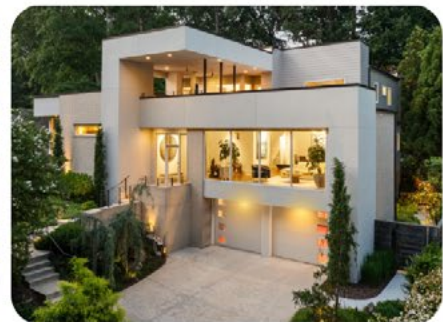
1242 WILD CREEK JUST LISTED $2.575M 1242wildcreek.com

NO AGENT HAS SOLD MORE $1M+ HOMES IN LAVISTA PARK THAN US